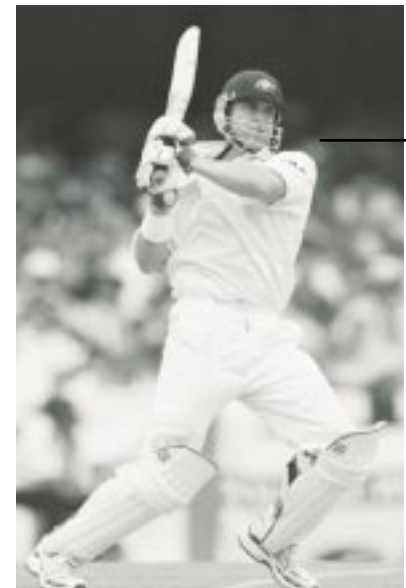
Former under-17 representative and current Australian Test opener Matthew Hayden continues to reach new heights with his powerful batting displays.