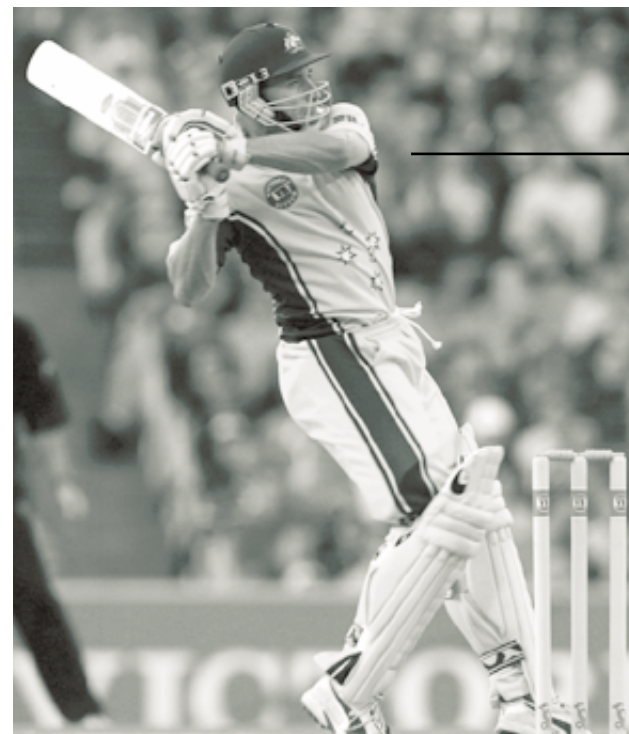
Michael Bevan remains one of the most successful cricketers to emerge from the ACT, having played the majority of his junior cricket in the territory.

TEST PLAYERS (1) MG Bevan ODI PLAYERS (Non Test) (1) BJ Haddin