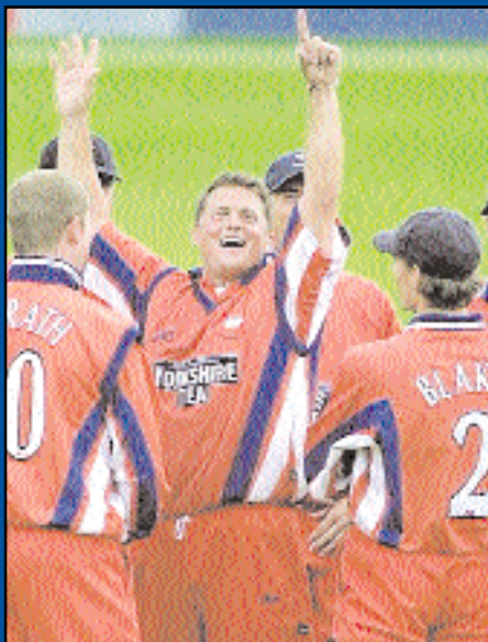
Phoenix celebrate another superb performance

N orwich Union National Cricket League leaders Yorkshire Phoenix have been named team of the month after four wins in a row during August.