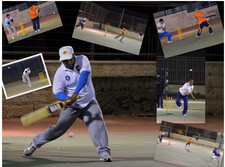
Night League Table 2012/2013

The Night Action Cricket League is heading towards the Play Off stage, with the top 2 positions earning an automatic place into the semi finals while teams finishing in positions 3-6 will have to play in a knock out match, with the winners reaching the semi finals. In what has been a remarkably close season, the league has already seen two tied matches, (Dialogz Dragons and Super Lions Lod) and (Yagod Morris Cricket 'A' and Gold Insurance Bet Shemesh Lightning) which resulted in two Super Over Matches.