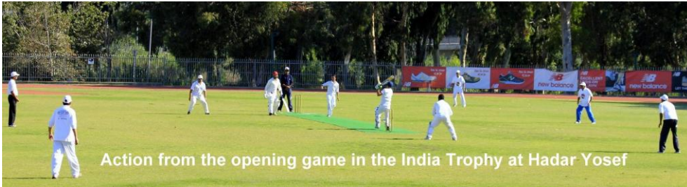
Action from the opening game in the India Trophy at Hadar Yosef