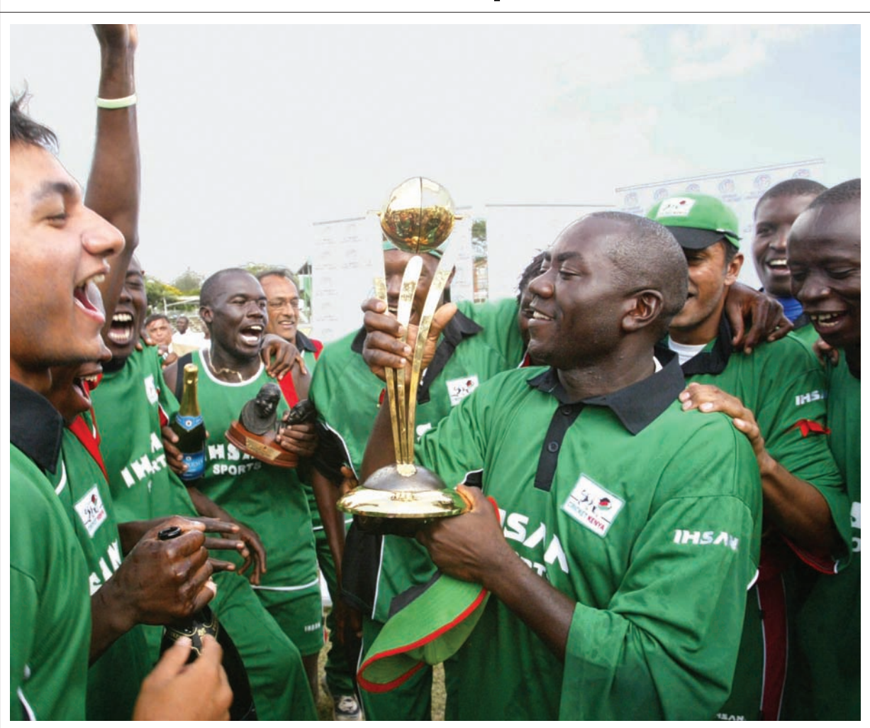
Steve Tikolo of Kenya leads his team in celebration in Nairobi after capturing the inaugural WCL Divsion 1 title.

Eight of cricket's emerging nations will be hoping to take one step towards ICC Cricket World Cup 2011 qualification at the ICC World Cricket League Division 3 in Darwin.